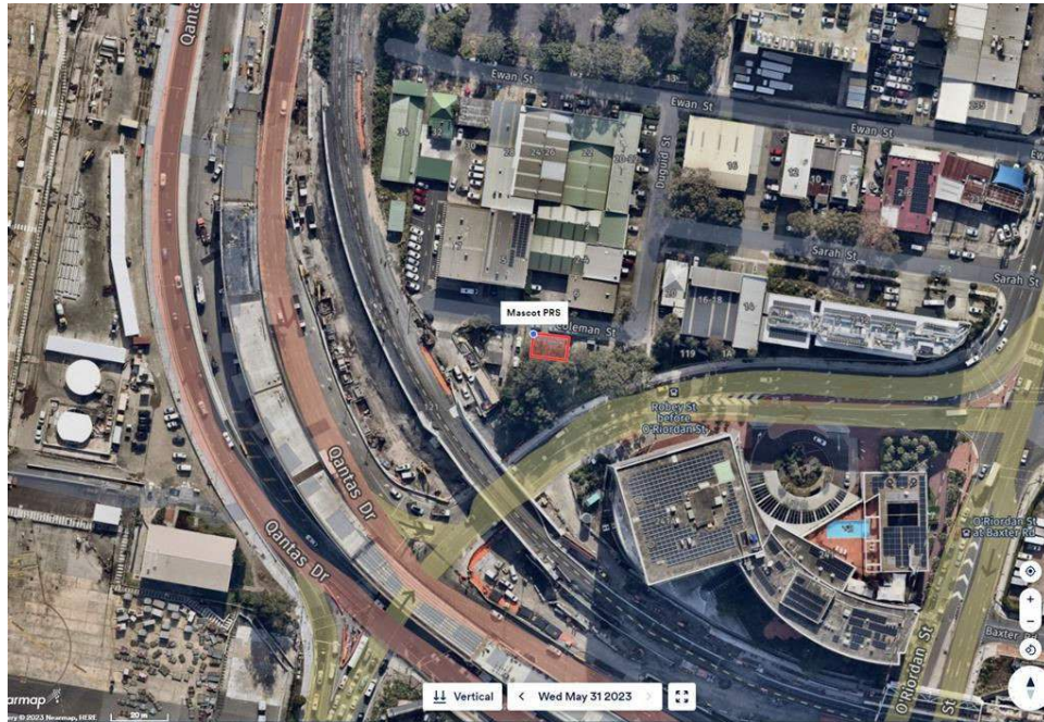
Figure 1: Mascot ALBV facility