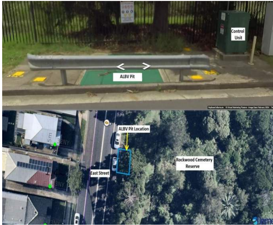
Figure 3: Lidcombe ALBV facility