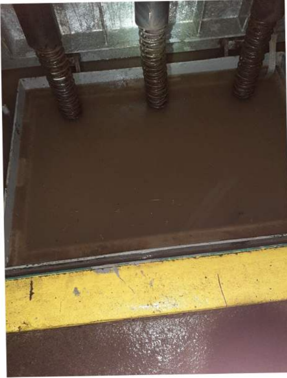
Fig 3: Wetherill Park ALBV Flooded with water