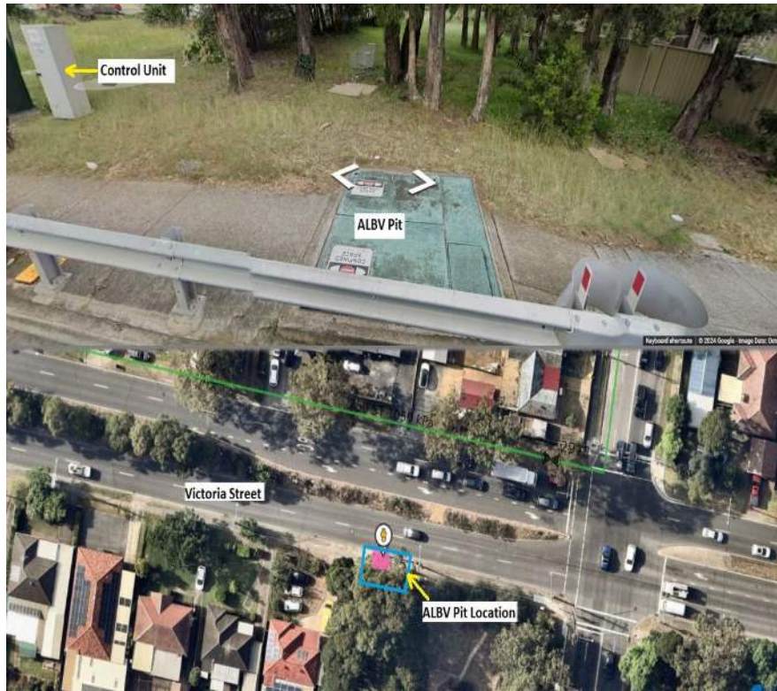
Figure 4: Wetherill Park ALBV Facility