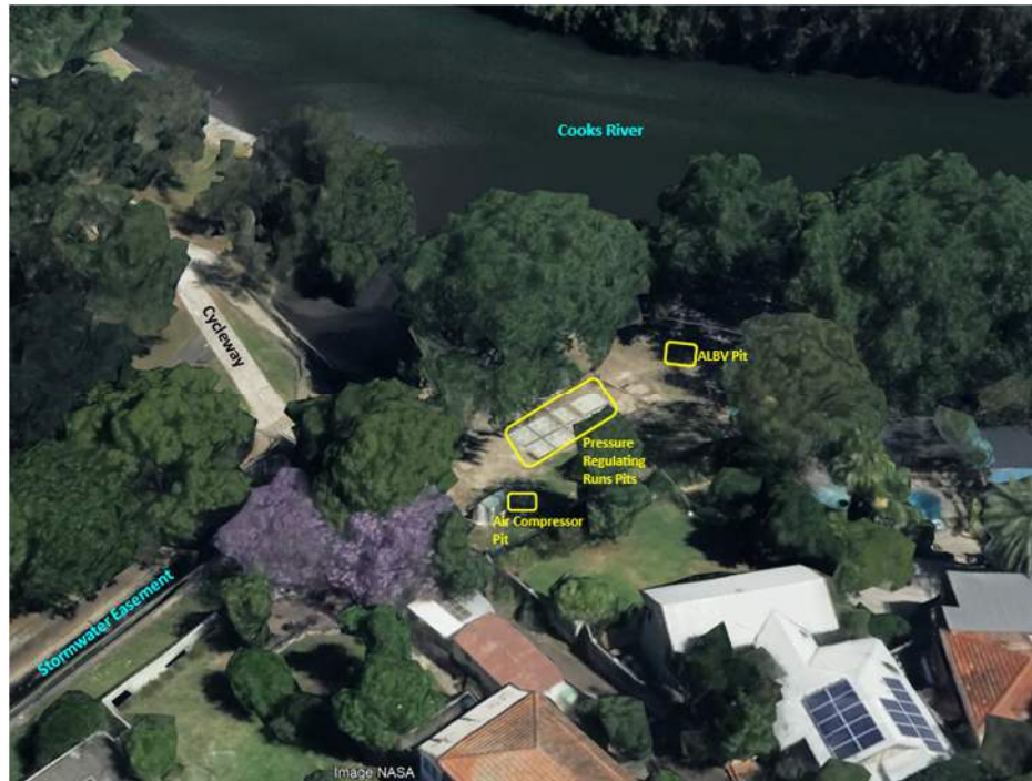
Figure 2: Tempe ALBV facility