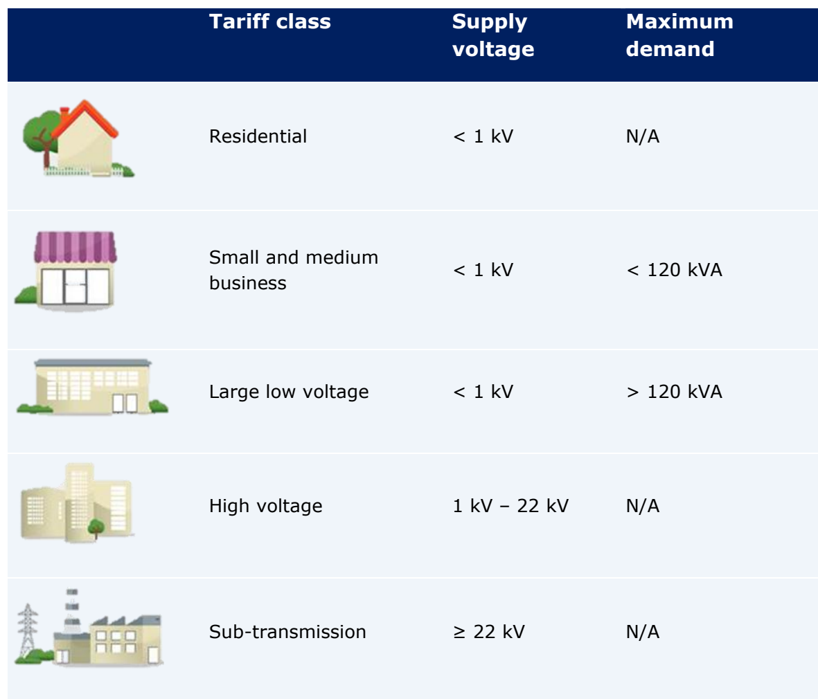
FIGURE 2 TARIFF CLASSES

Our network tariffs can be grouped into the following tariff classes: