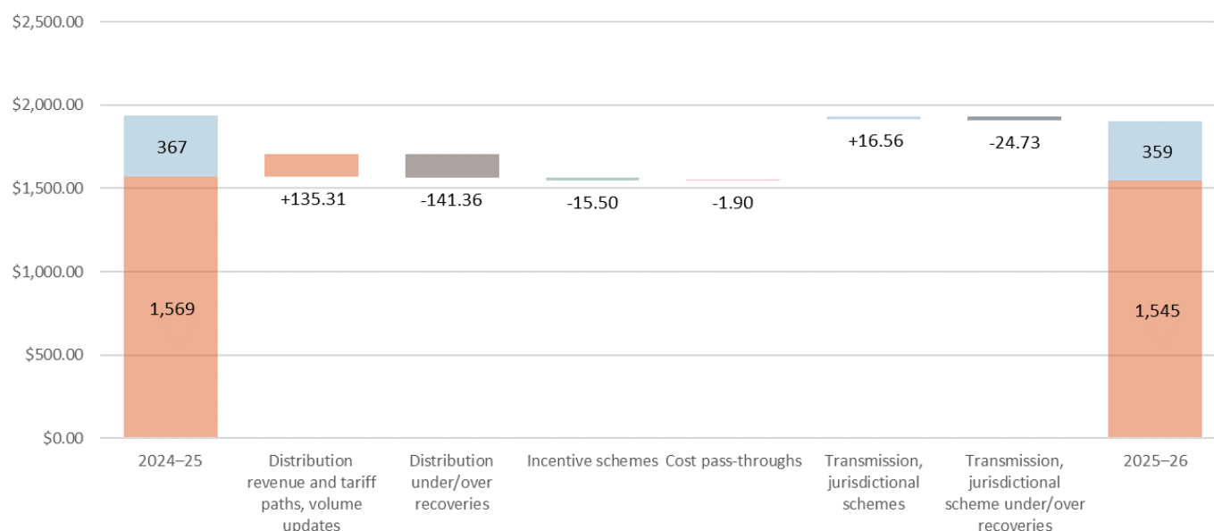
Figure 2 Small business: Average annual network charge