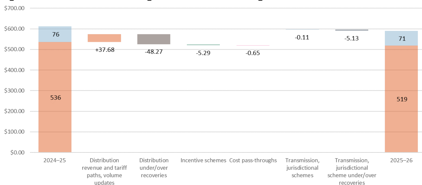
Figure 1 Residential: Average annual network charge

Source: AER analysis; Jemena’s 2025–26 pricing proposal.