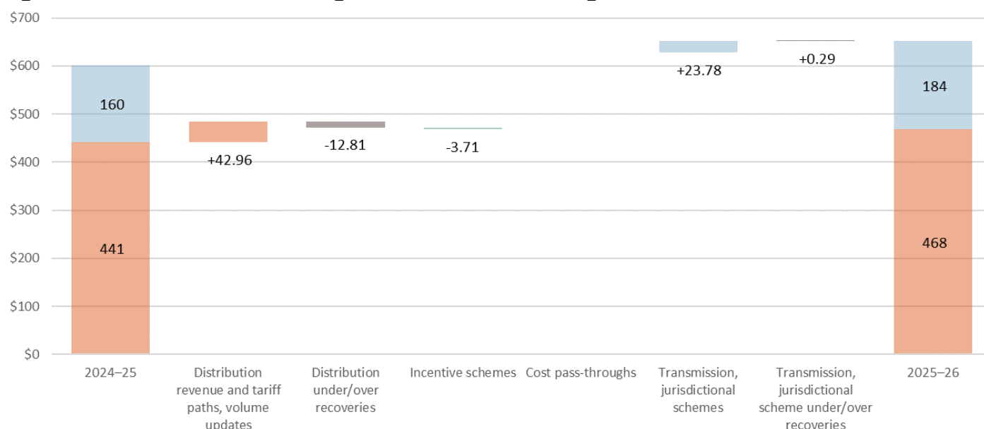
Figure 1 Residential: Average annual network charge