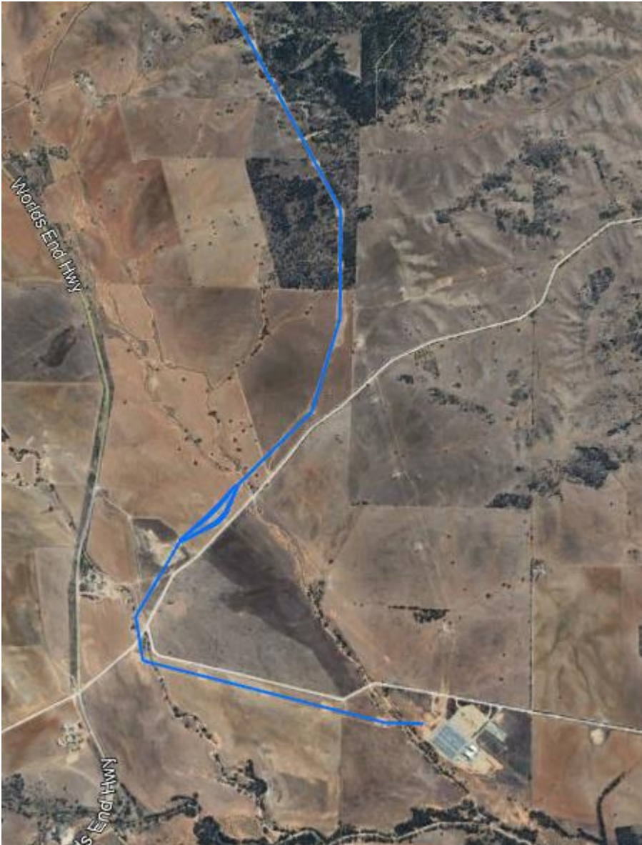
Diagram A1-2 – Robertstown Substation close up