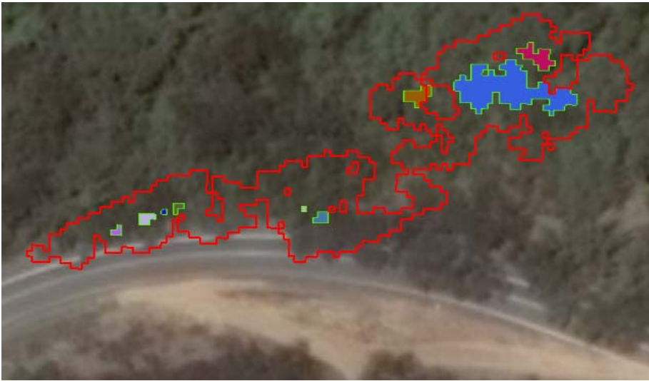
Table 3.7.2.5 – Representation of defect vegetation areas. Red outline shows a single contiguous in 2014 (n = 1), but subsequently in 2015 the defects have reduced in size but are separate areas (n = 9).

An increase in number of defects per span in 2015 is due to the manner in which vegetation encroachments are collected and classified. The defect classification for 2015 factors in the span length and voltage to determine clearance requirements and therefore defect. Technology, LiDAR sensor and processing improvements have enabled more detailed data acquisition. This detail means a single defect in 2014 may have been represented by a larger contiguous area, whereas with the improvements individual canopies and encroachment defects are identified. Additionally, following vegetation trimming and clearance, regrowth will result in a greater number of smaller individual canopies which are detected as individual defects. In total, due to the above improvements the number of defects has increased but the area of vegetation causing the defect has decreased. In 2014, the total area for vegetation defects was 17,469,898.20 m 2 whereas in 2015 the total area was 8,133,267.48 m 2 (a reduction of approximately 53%). Figure 3.7.2.5 (below) shows an example where a large contiguous area of defect vegetation (n = 1) has been cleared but regrowth has been detected as a number of smaller defect areas (n = 9).