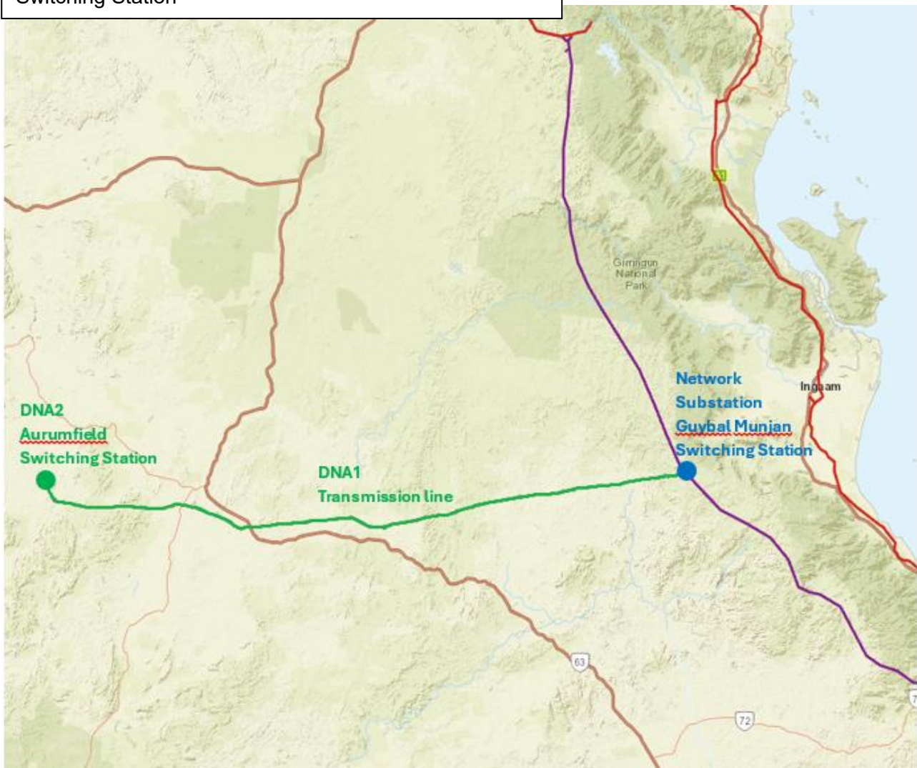
Figure A1 – Guybal Munjan Substation to Aurumfield Switching Station

The Kidston DNA is a ~186 km 275 kV transmission line running from the Aurumfield Station west of Greenvale to the Guybal Munjan Switching Station near Mt Fox where it connects into the existing Queensland transmission network.