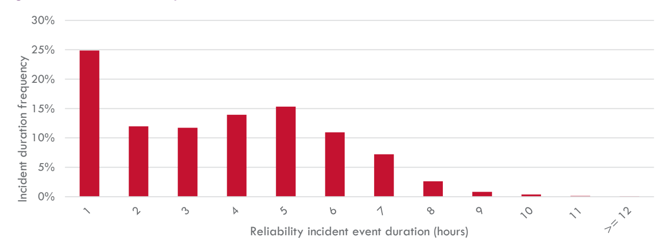
Figure 2 Forecast reliability incident duration in New South Wales 2025-26

Figure 2 shows the duration of expected USE in New South Wales in 2025-26. USE events in this year are forecast to most frequently be one hour long, but many USE events are forecast to stretch over five hours.