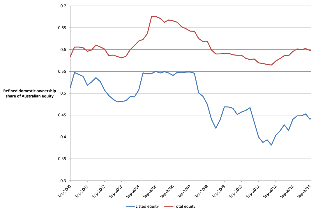
Figure 4-3 Refined domestic ownership share of Australian equity