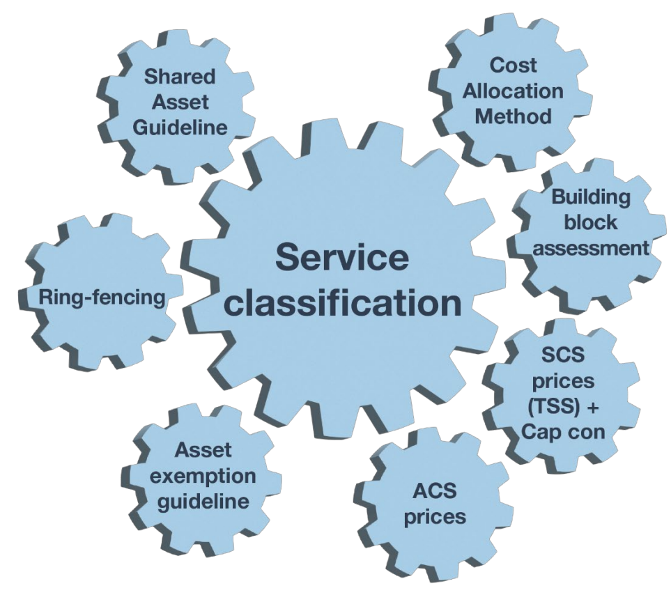
Figure 1.1 Interaction between service classification and other elements of the regulatory framework

As a result, our service classification decisions, and other issues that are decided through the F&A, form the regulatory foundation of the distribution determination we make for each distributor, for each five-year regulatory control period in determining the total amount of revenue recovered from consumers.<sup>5</sup>