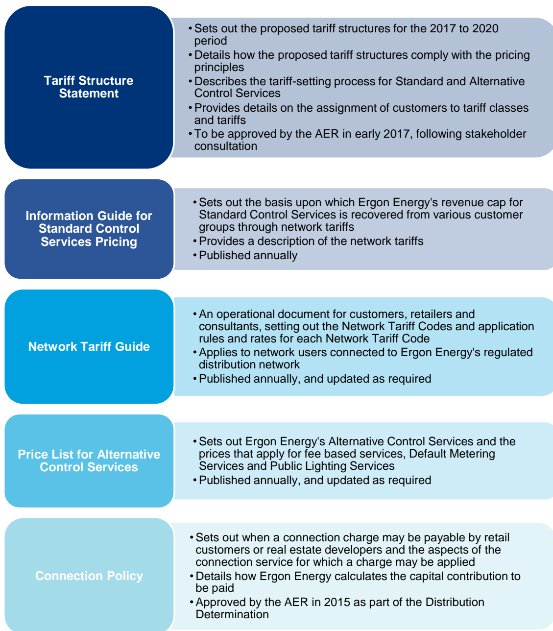
Figure 1.1: Supporting network pricing documentation