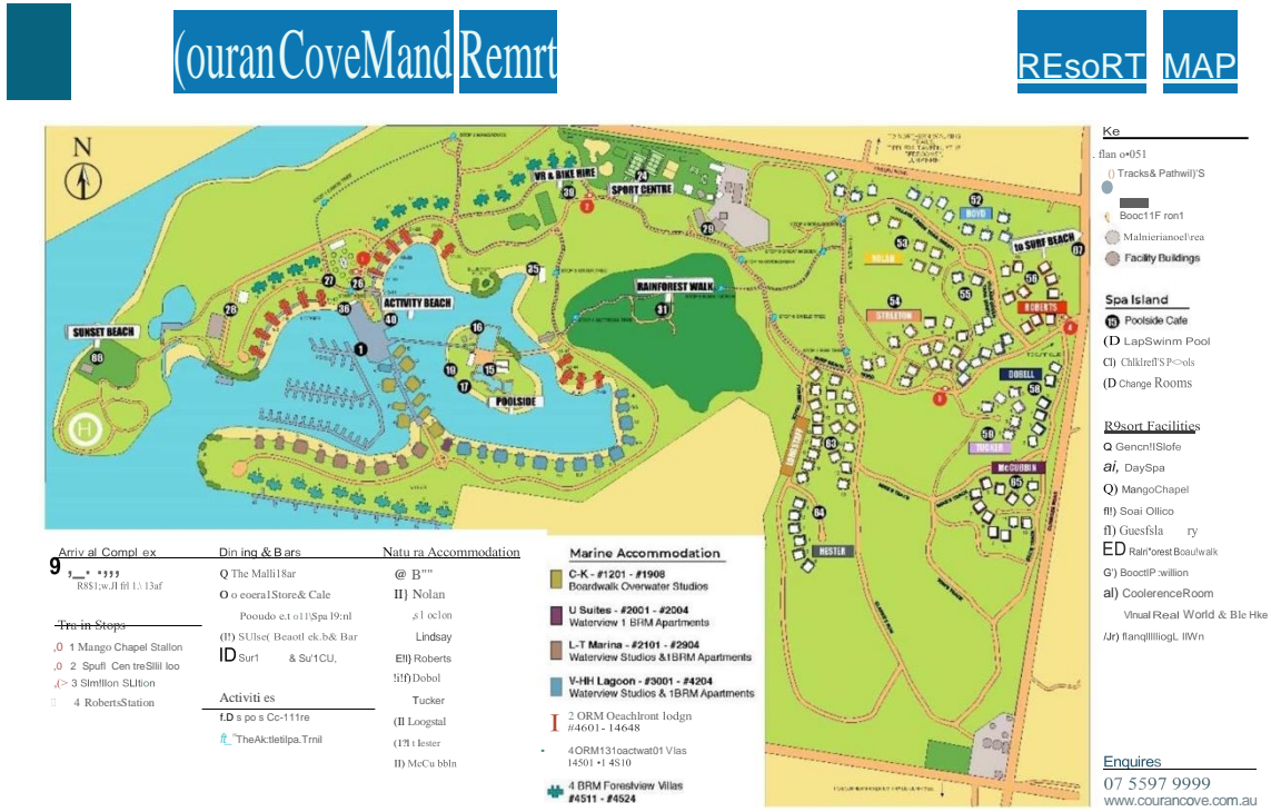
Figure 1. Resort Map