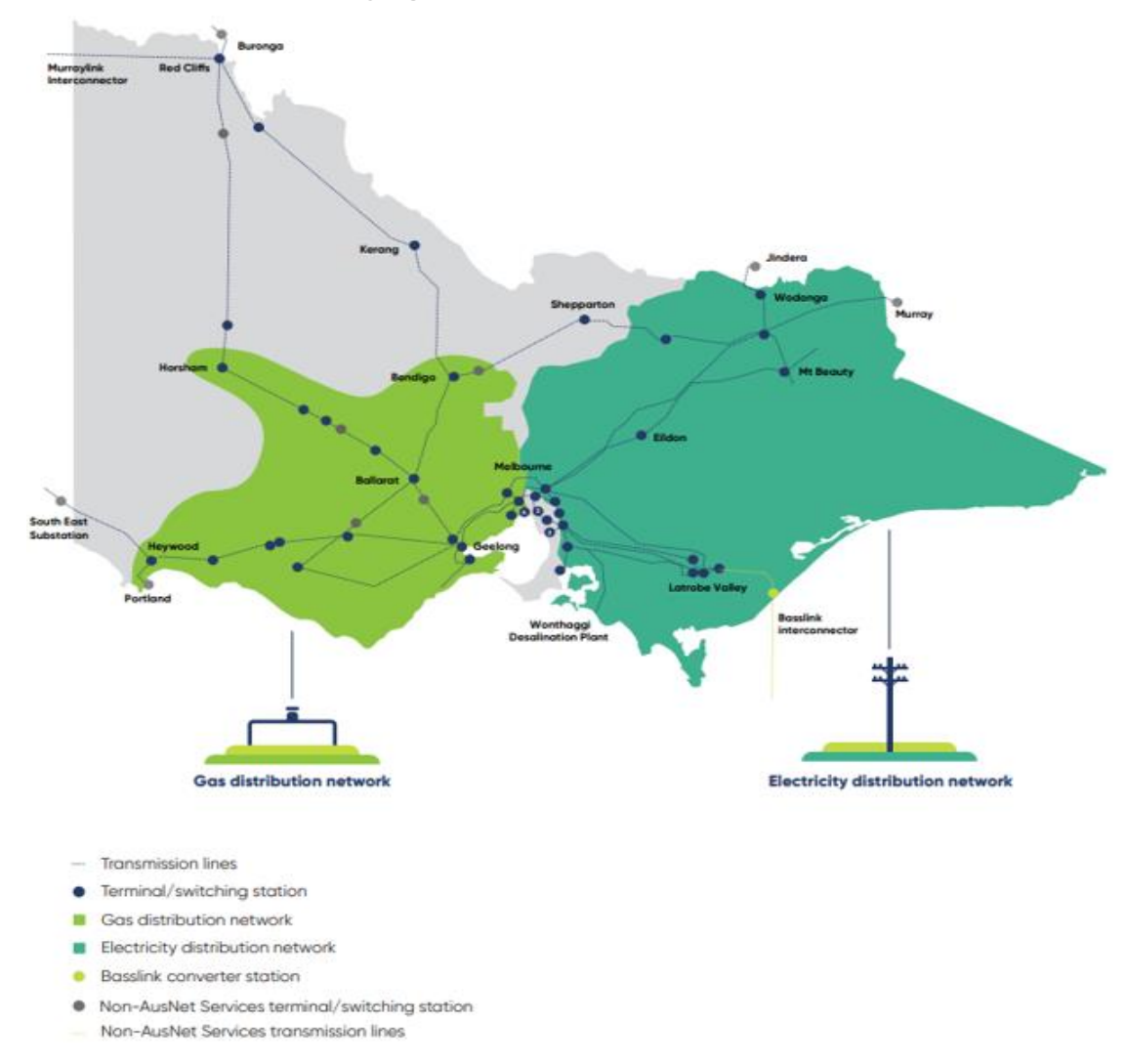
Figure 1.1: AusNet's Gas and Electricity regions

AusNet manages a Victorian gas distribution network, supplying natural gas to over 752,000 residential and business customers in western Melbourne, central and western Victoria, through our network of underground gas pipelines. AusNet's gas distribution area is shown in Figure 1.1 below.