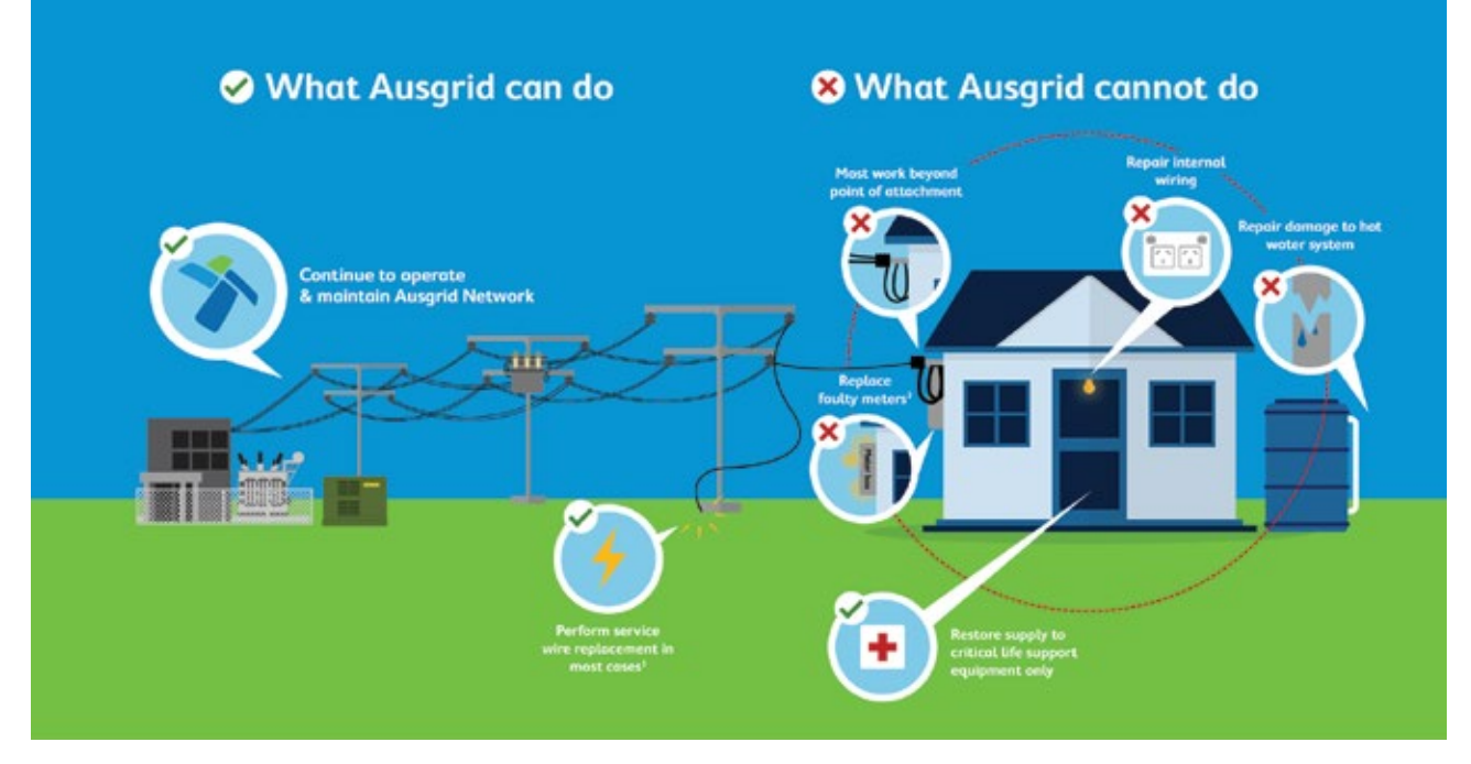
FIGURE 2: LEGAL SEPARATION AT AUSGRID

Illustrative example of services Ausgrid can and cannot provide from 1 January 2018.