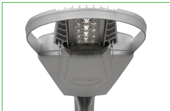
Figure 3 CREE XSPR 42/25 Watt LED Luminaire US$99 “in quantities”

Such aggressive and game-changing pricing from international industry leaders has sent shockwaves through the worldwide industry and has drawn product pricepoints generally down to levels that provide for the lowest life cycle costs of any lighting technology in 2014. Initial prices for Australian-sourced LED luminaires have not yet filtered down to such levels, but prices are steadily decreasing, and performance is increasing.