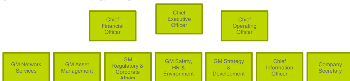
Figure 1: Endeavour Energy's organisational structure

Endeavour Energy are a 'poles and wires' business, responsible for the safe and reliable supply of electricity to 2.4 million people in households and businesses across Sydney's Greater West, the Blue Mountains, Southern Highlands, the Illawarra and the South Coast.