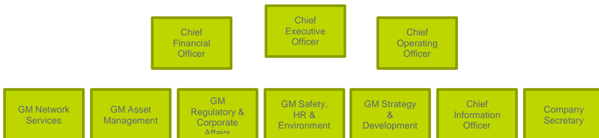
Figure 1: Endeavour Energy's organisational structure

Endeavour Energy are a 'poles and wires' business, responsible for the safe and reliable supply of electricity to 2.4 million people in households and businesses across Sydney's Greater West, the Blue Mountains, Southern Highlands, the Illawarra and the South Coast.