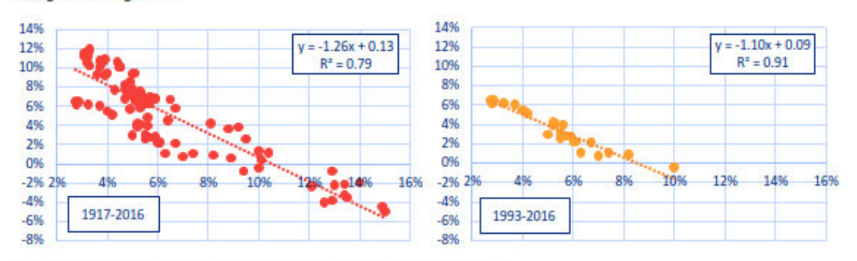
Figure 5.2: MRP (vertical axis) vs nominal bond yield (horizontal axis). MRP measured as DGM cost of equity estimate (based on outturn data) minus nominal bond yield. DGM assumes long-term growth equal to 40-year average of GDP growth.