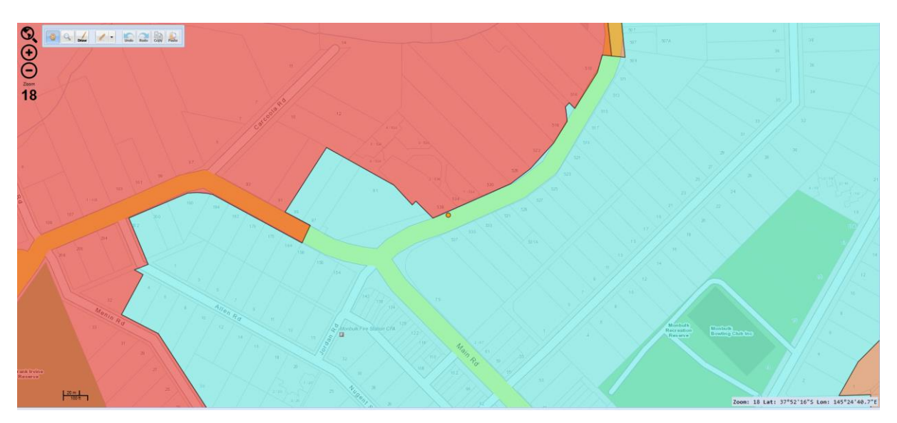
Figure 1: Incident location relative to the F-factor boundaries