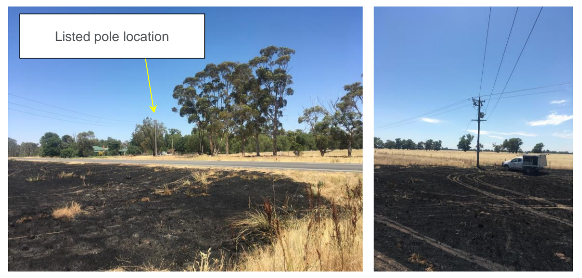
Figure 2: Photos showing the location of the fire relative to the location of the impacted pole