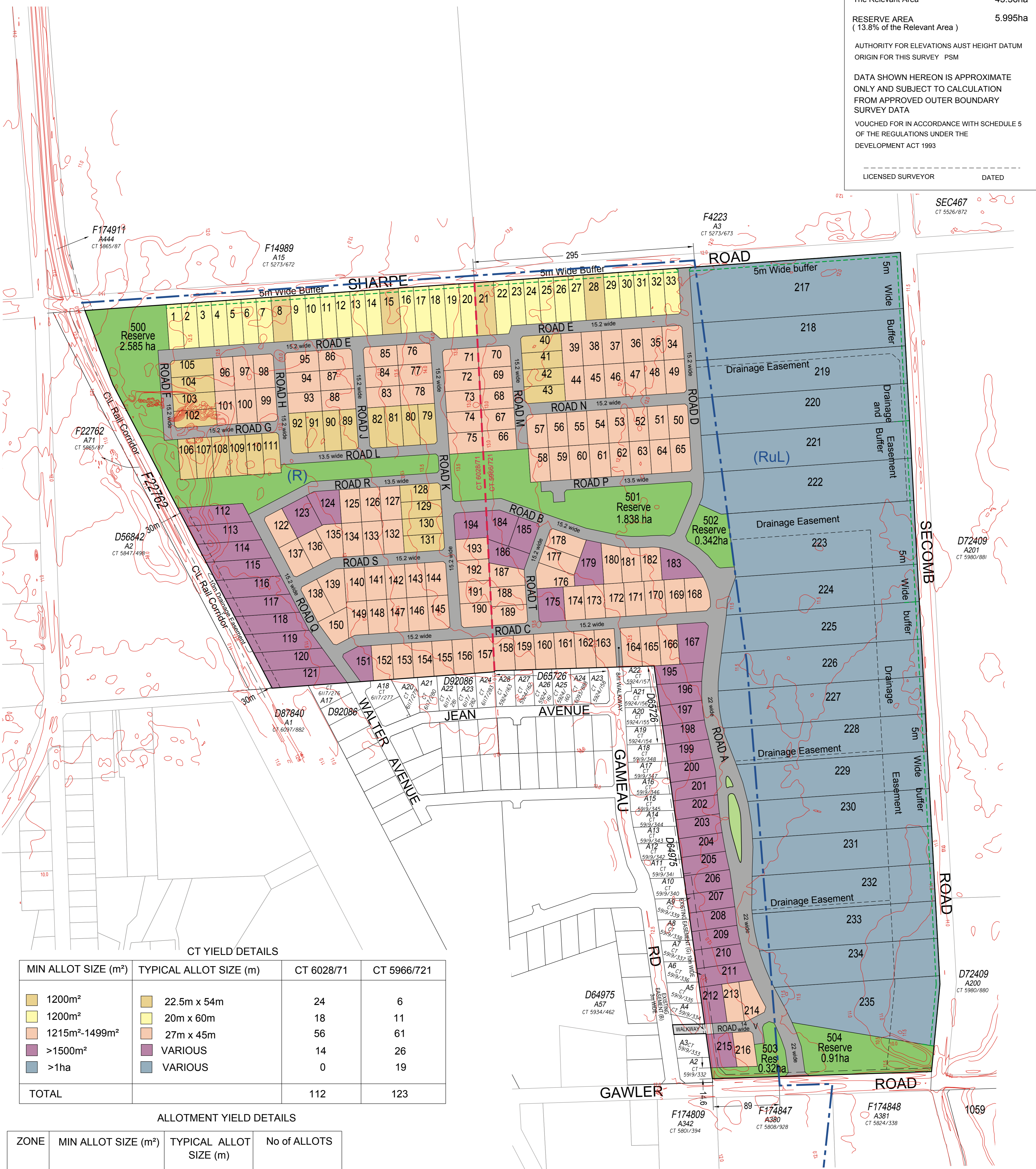
CT YIELD DETAILS