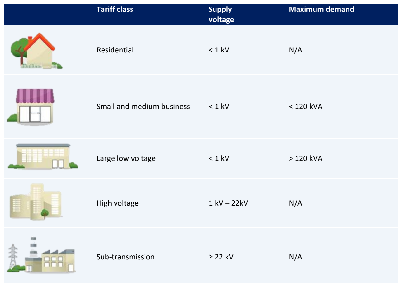
Figure 1 Tariff classes

All alternative control services are a separate asset class.