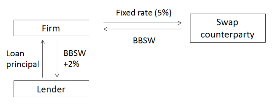
Figure 1: Example of floating rate debt and interest rate swaps