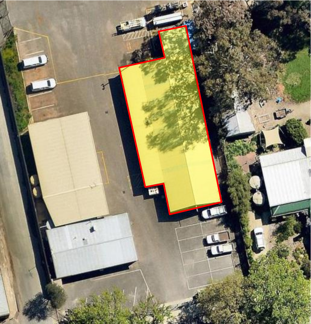
Workshop / Store