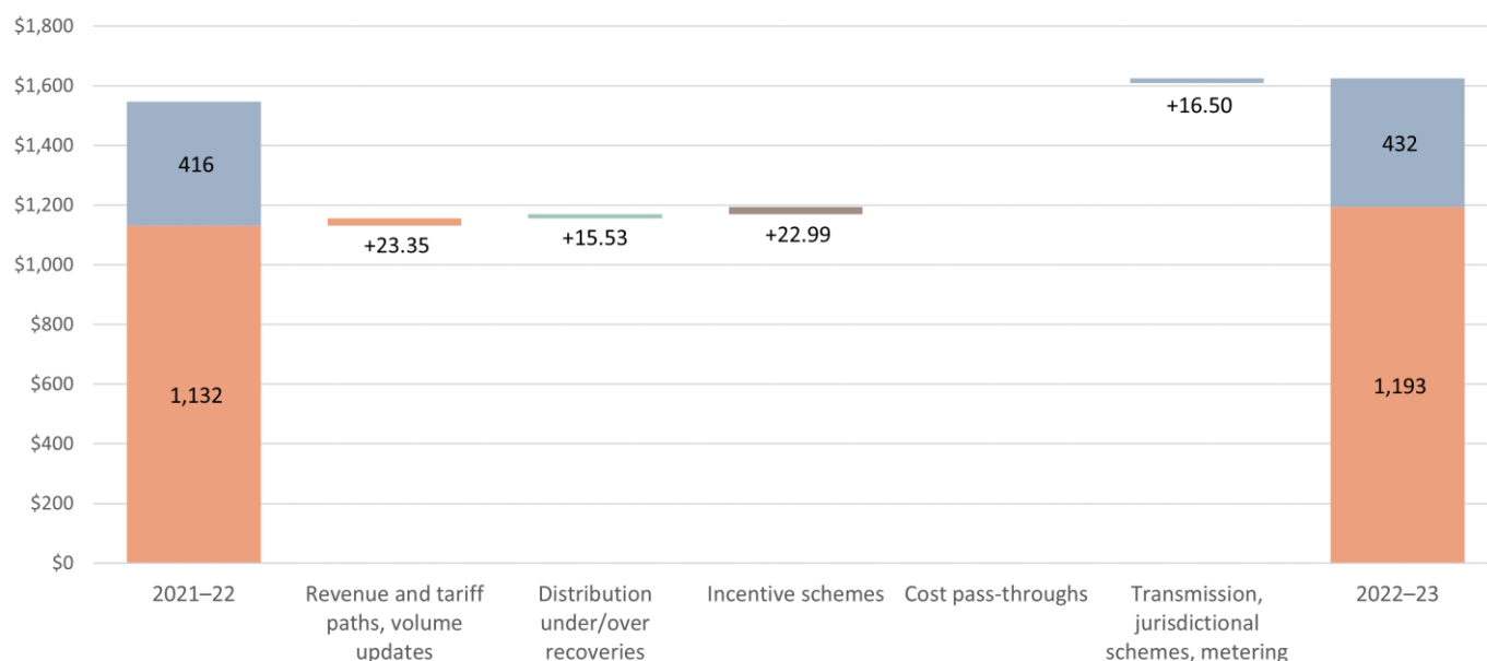
Figure 2 Small business: Average annual network charge