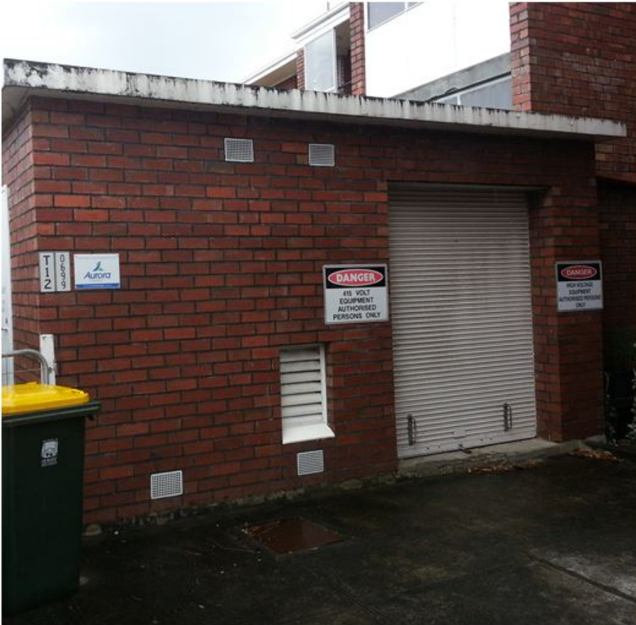
Figure 1 - Typical building type substation - Exterior view

Throughout the 60's and 70's 131 building type substations were built and now their condition is deteriorating, the age profile of these substations can be seen in Figure 1. The deterioration has started to cause roofs to become compromised and let water ingress, resulting in some cases of partial roof collapse. These incidents have caused performance issues as well as increased cost due to removal of asbestos in most cases.