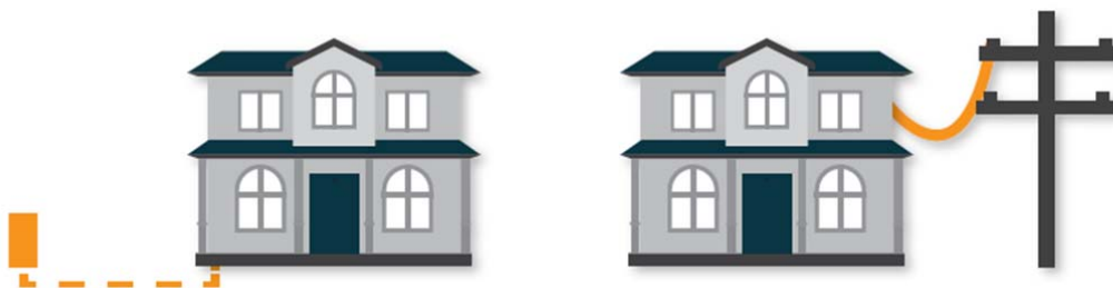
Figure 1 – Basic connection

TasNetworks is required to provide a connection offer to a connection applicant within 10 business days of the connection applicant submitting a satisfactorily completed application form.