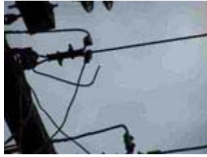
Loose connection at pole