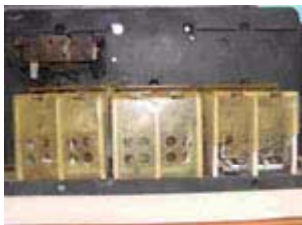
Loose connection at Mains Box