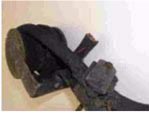
Damage at roller bracket