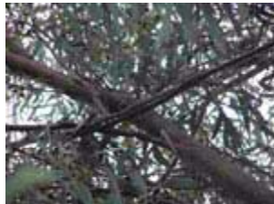
Service rubbed thru by tree